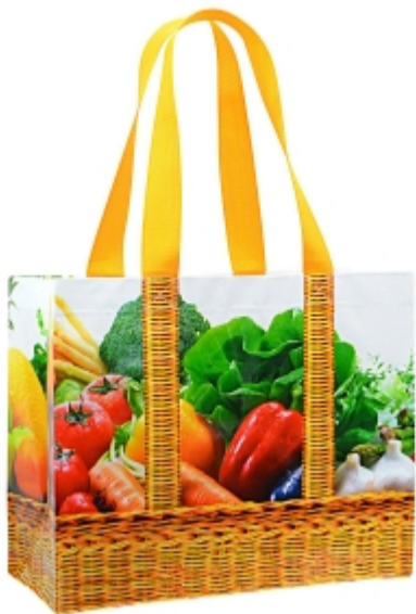
Plate Charge *: $200/color